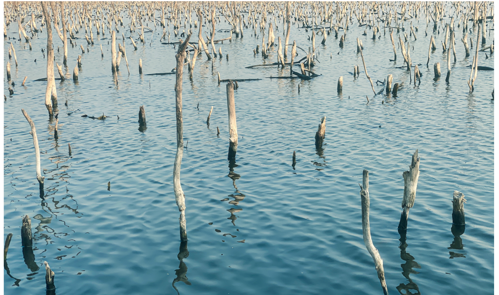
Branches of dead mangrove trees

And the negative effects do not stop there - where mangroves are removed to accommodate the rapidly expanding aquaculture industry, the threat to biodiversity becomes profound. Shrimp farms – which are linked to as much as 38% of global mangrove deforestation – require large amounts of water and are consequently found alongside rivers and estuaries. During the conversion of wetlands to shrimp farms, seawater is diverted inland to supply their ponds.