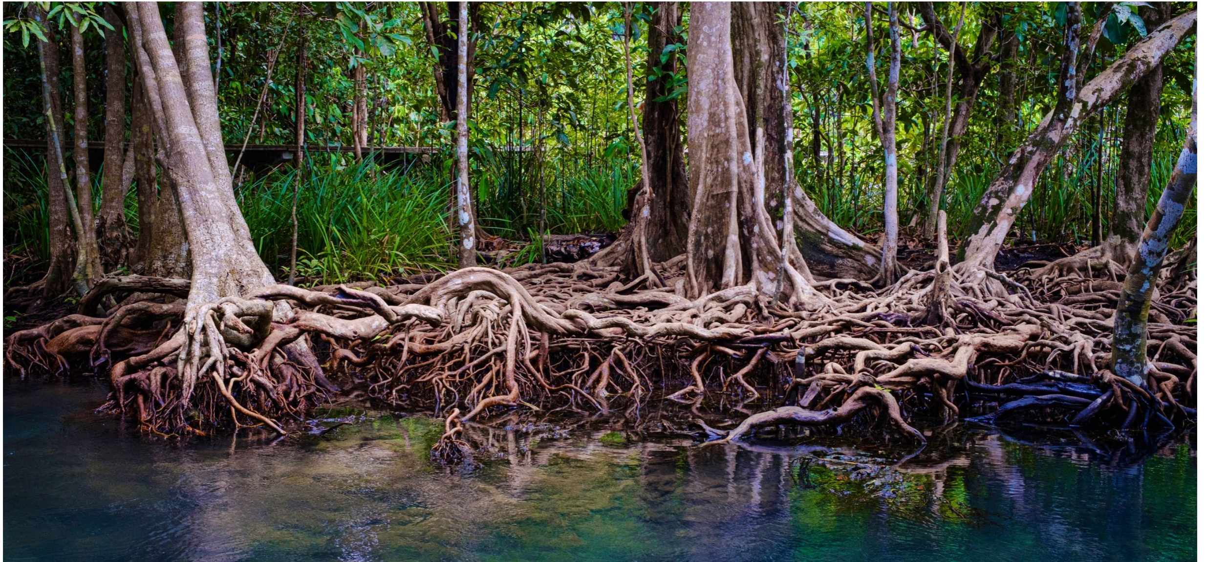
Mangrove roots exposed to air during low tides

It's estimated that more than half of the world's GDP – equivalent to USD ~58 trillion – is moderately or highly dependent on nature.